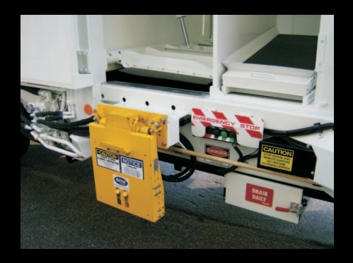
■ Conveyor system designed for split body applications, eliminates the need to manually pitch material. Greatly reducing operator fatigue.