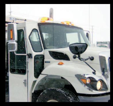
■ Wide range of beacons, directional arrows, X-Pattern flashers, etc.