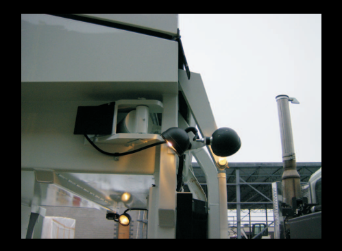
Multiple work lights to illuminate the night. Accident avoidance systems with up to four active cameras.