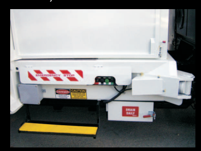
■ Hopper steps with integrated safety pads to interrupt power.