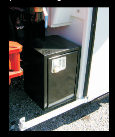
S Custom storage boxes both heated and non.