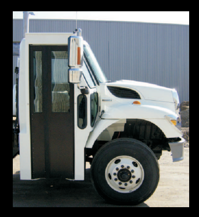
Automated bifold doors open with work-brake and close when operator returns to cab.

We also offer broom and shovel holders, heated floors, auxiliary heaters for the stand up side, cart tippers, glove warmer, safety kits, fire extinguishers, L.H. packer controls, dash mounted fans, reflective triangles, etc. We can add just about any option you can think of just ask and we'll see what we can do to make the ideal truck for your application.