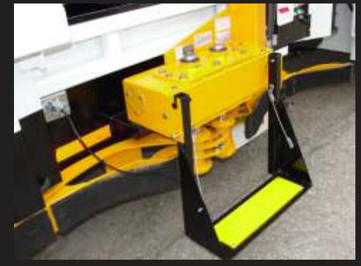
Hopper steps with integrated safety pads to interrupt power to the arm.