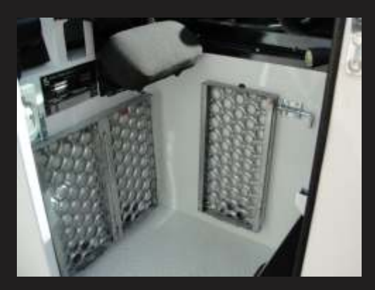
Adjustable floor grates.

Accident avoidance systems with up to four active cameras.