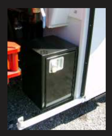
L Custom storage boxes both heated and non.