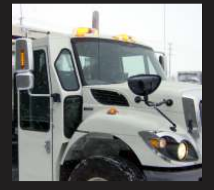
Wide range of beacons, directional arrows, X-Pattern flashers, etc.